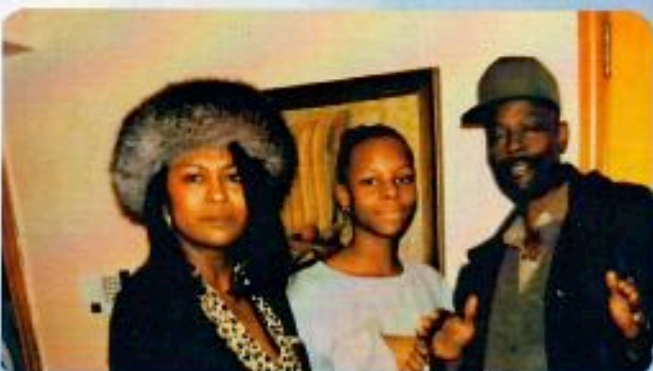
can honestly say he was the muscle 🌟❤️